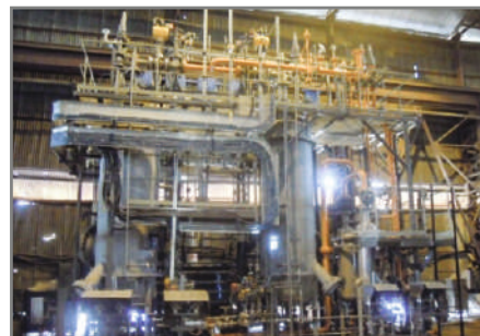
Ethylene dryer for Opal- Dahej

LEWL major clients included ONGC, NPCIL, BOC GAIL NRL Numaligarh, MRPL Mangalore, Mangalore Fertilizers, Technip, Madras Fertilizers, Chennai, IOCL, SPIC, BPCL, Fertilizers Corporation of India, IFFCO, ISRO, SHAR, JK Synthetics, RCF Mumbai, Zuari Agro, IPCL etc. For Nuclear Power Corporation LEWL have supplied Heavy Water Vapour Recovery Dryers for their TAPP, Tarapur, KAIGA, KAPP & RAPP projects.