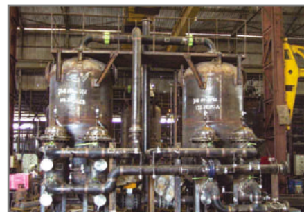
3 nos Air Dryer Unit 3 Type : Heatless, Capacity : 13400 NM /hr For Paradeep Refinery project of IOCL

Skid mounted Drying package for Air, Liquid and Gases