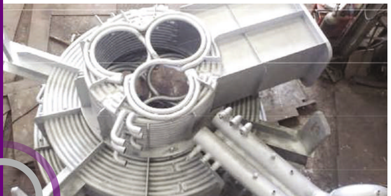
Furnace roof for JSW through SMS Siemag