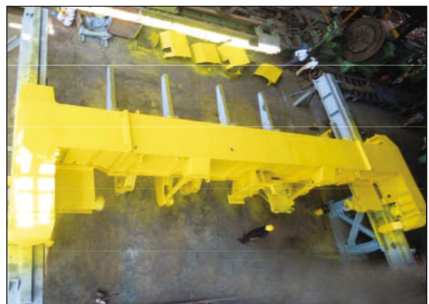
Charging Machine for RSP Project through Tenova