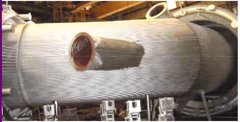
Upper hood section 2 for IISCO Burnpur through SMS Siemag