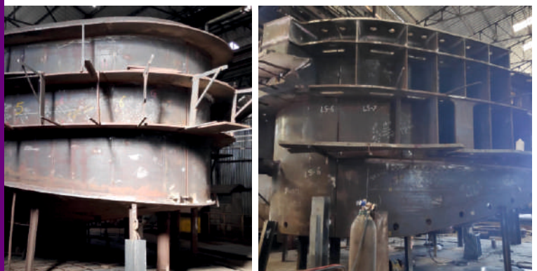
Lower Shell- Bhushan Steel