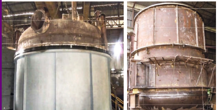
VD Vessel & Cover Assembly for SMS Siemag