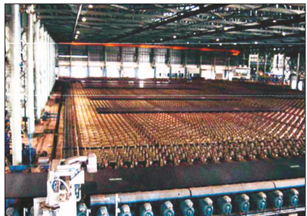
Cooling Bed 60 Mtr x 80 Mtrs with roller tables for Welsupn Anjar for Plate Mill Project