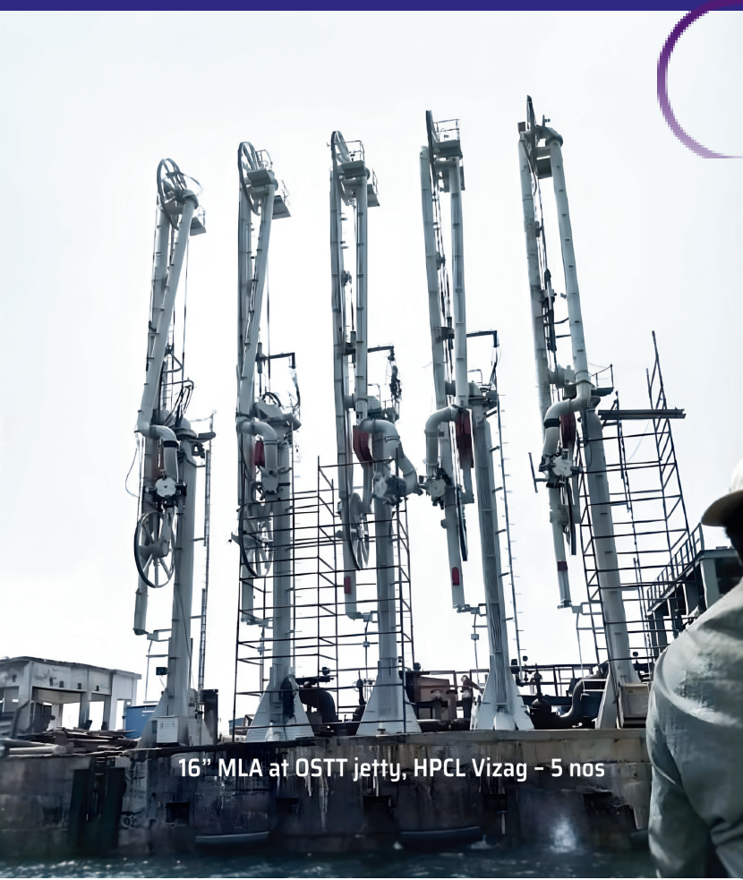
16" MLA at QSTT jetty, HPCL Vizag - 5 nos

LEWL adopted the expertise to carry maintenance in-cito condition with their experienced site team over the years.