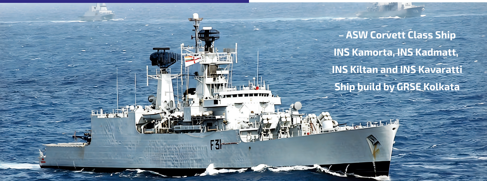
- ASW Corvett Class Ship INS Kamorta, INS Kadmatt, INS Kiltan and INS Kavaratti Ship build by GRSE Kolkata