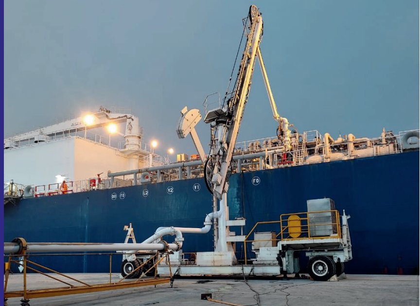
Trailer mounted marine unloading arm with jumper assembly for liquid ammonia services

LEWL stands at the forefront in India, delivering an integrated single point solution for supply, erection & commissioning of the Loading systems with the experienced Engineers team. Also the clients getting service support on call after sales within India by local engineers available. AMC services are also provided by LEWL across Indian Ports.