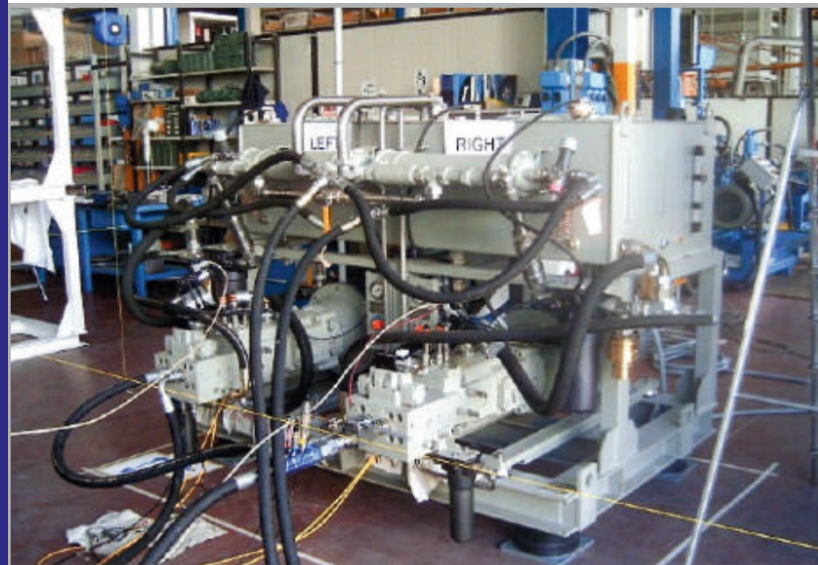
- Steering Gears with Controls for P28